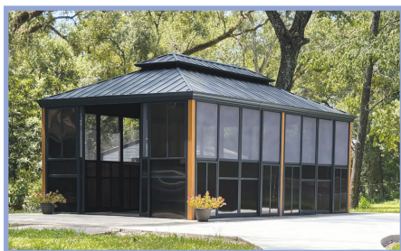
The perfect place to gather, garden, and grill... our new Gazebo provides a fully accessible outdoor space for everyone in the community!

We thank the Powers' Family Foundation for their continued support of L'Arche Jacksonville. This spring, a match campaign – Springing Forward to a New Gazebo – assisted in raising funds to renovate the courtyard. Friends of L'Arche jumped into action and donated dollars to fulfill the match guarantee.