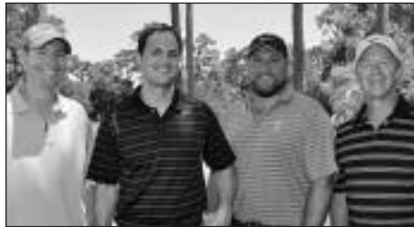
Congratulations to First Place team winners.