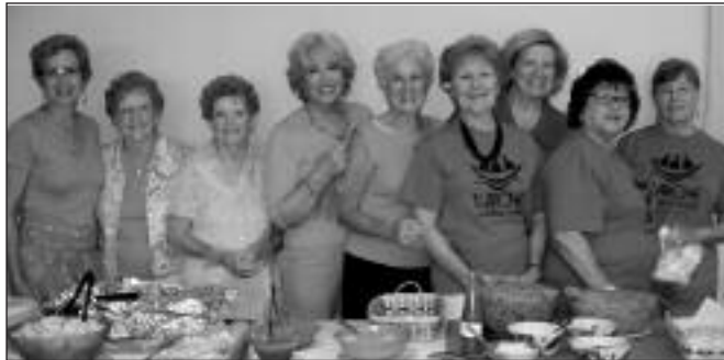
The Auxiliary prepared a festive Cinco de Mayo celebration for the First Thursday Community Night on May 5. The L'Arche community and friends enjoyed the festive decorations and authentic Mexican food and music.

Contact us for details about future meetings - guests and prospective new members are always welcome!