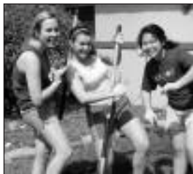
Planting a garden can be fun!

They lived in the homes with our core members and created lasting relationships. They also participated in various service projects around our campus and the Rainbow Workshop. The night before they departed, the community celebrated with a farewell dinner with delicious food and lots of fun.