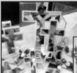
The Rainbow Sale featured mosaics, jewelry, ceramics and many other beautiful gifts.